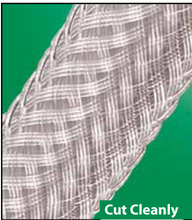
Cut Cleanly Hot Knife