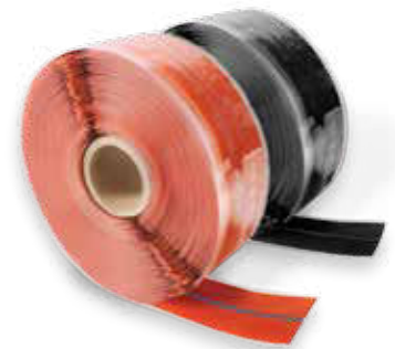
Colored guide line only on TGL (Triangular Guide Line) tapes.