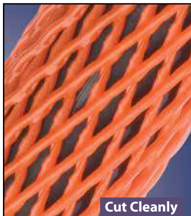
Cut Cleanly Scissors