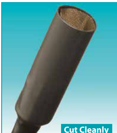
Cut Cleanly Scissor