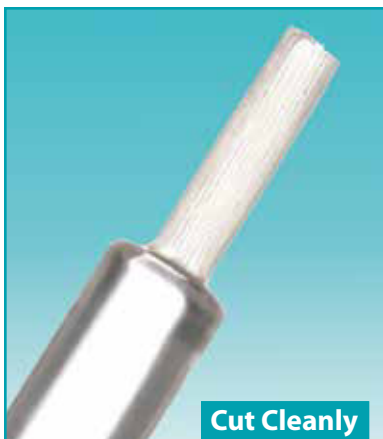
Cut Cleanly Scissor