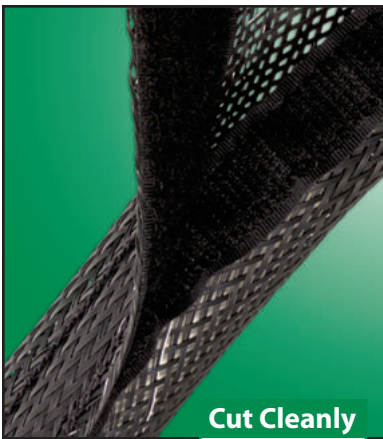
Cut Cleanly Hot Knife