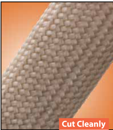
Cut Cleanly Scissors