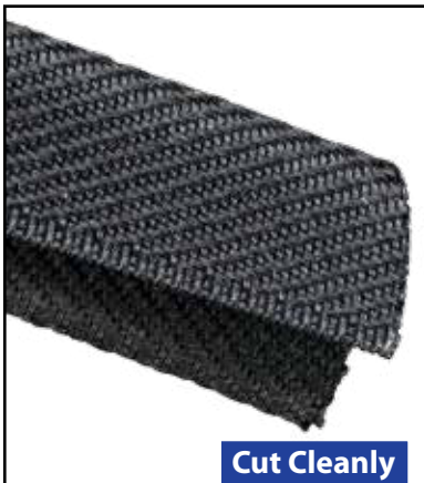
Cut Cleanly Scissors