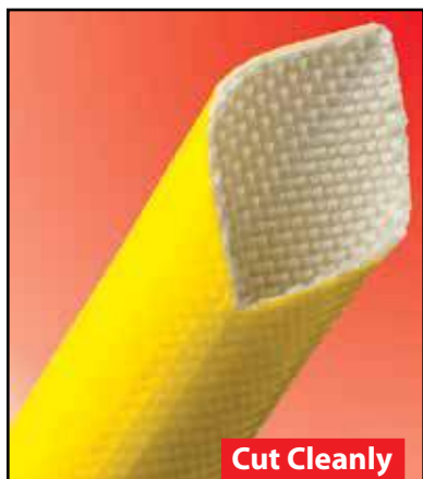
Cut Cleanly Scissors

Acrylic Flex Glass is used in applications such as relays, radio circuits, transformers, and lead/crossover protection on motors. Highly resistant to acids and solvents, and will withstand tough assembly handling. Sleeving is recommended for thermal requirements from 105°C (221°F) to 155°C (311°F) ranges.